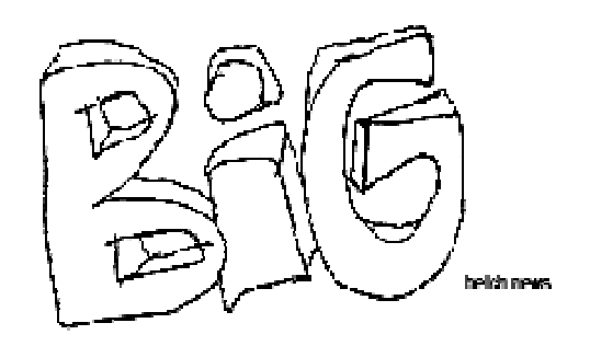
issue 115 january 11, 2016

hello. The powerball jackpot has risen to $800,000,000. That is too much money for one person to win from the lottery. I think there should be a limit to how much you can win from the lottery. Because 800 million dollars is stupid. Imagine what too charity could do with that. Or just give it all to homeless people. Not one person who already has a place to live. But I guess nobody would pay to give homeless people. money to Heartless morons. Humans are so greedy.